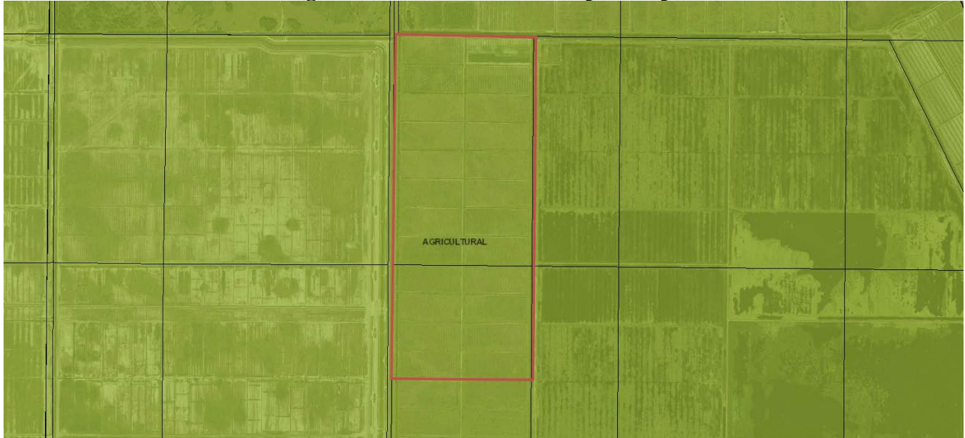
Figure 5: Future Land Use Map Excerpt

Surrounding properties all have a land use designation of Agricultural