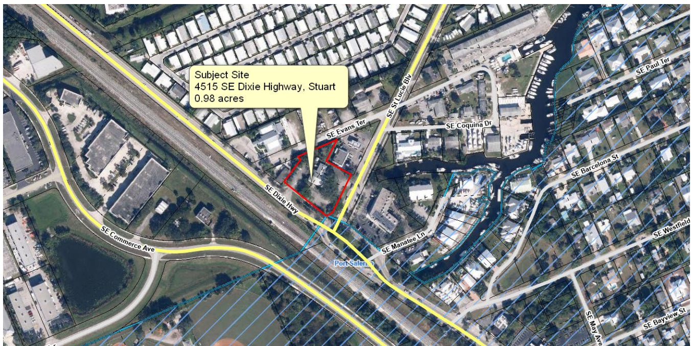
Figure 1 Location Map